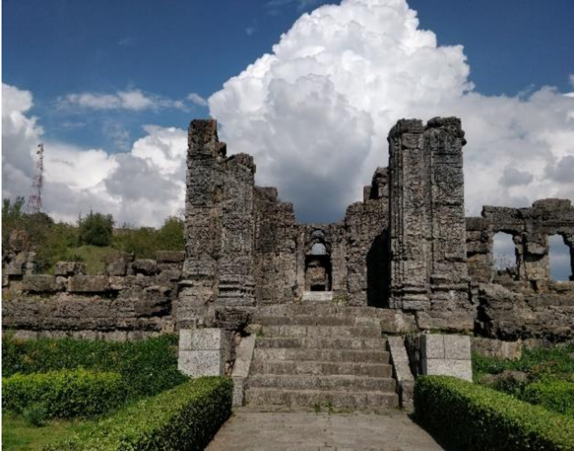
Figure 2: Entrance of Martand Sun Temple