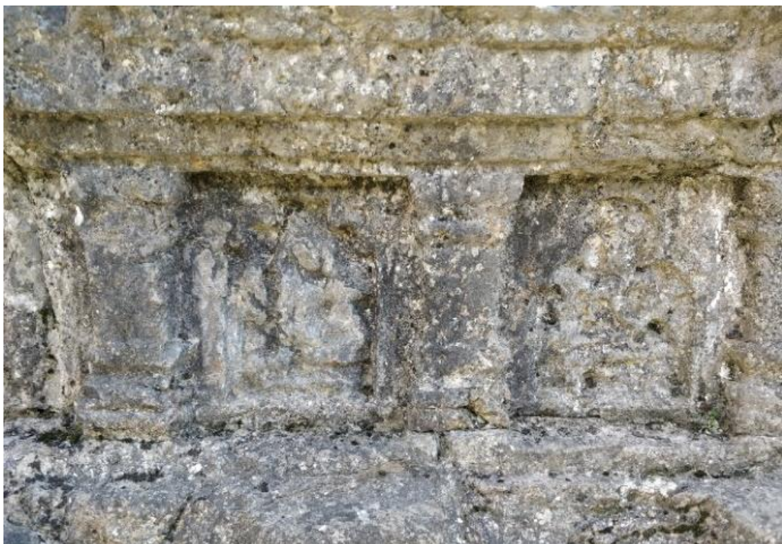
Figure 10: Partially damaged carvings in Martand Sun Temple