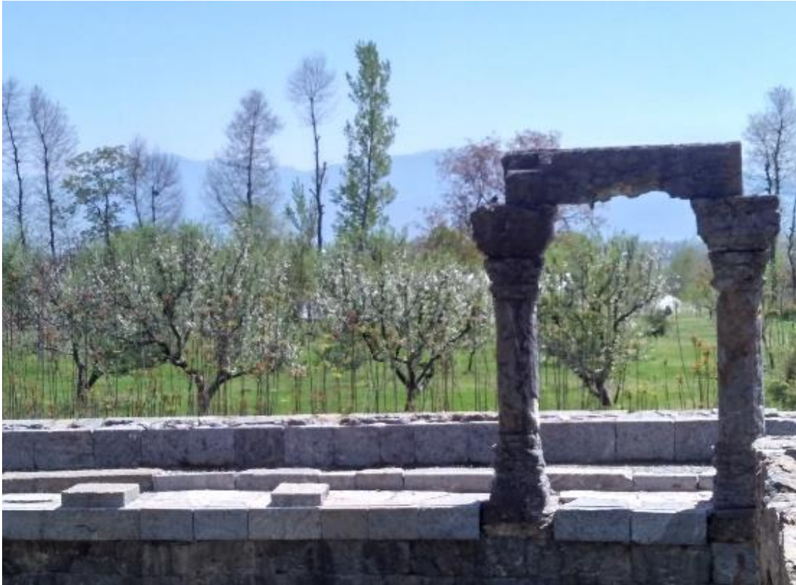
Figure 7: Two columns (part of pradakshina path) in Martand Sun Temple

An appreciable work has been done by the Archeological Survey of India but it is a sluggish development over a longer period of time. Until and unless there are no enhancements from the mistakes done periodically there cannot be a face-lift of the Martand Sun Temple.