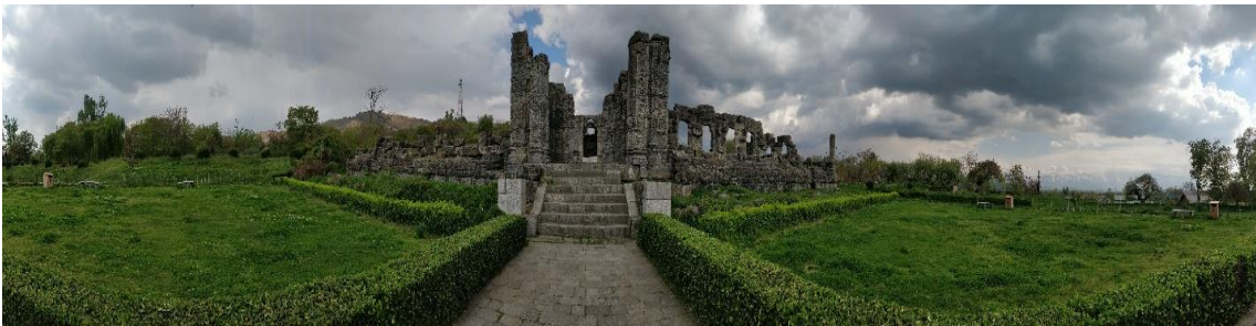
Figure 3: General View of Martand Sun Temple