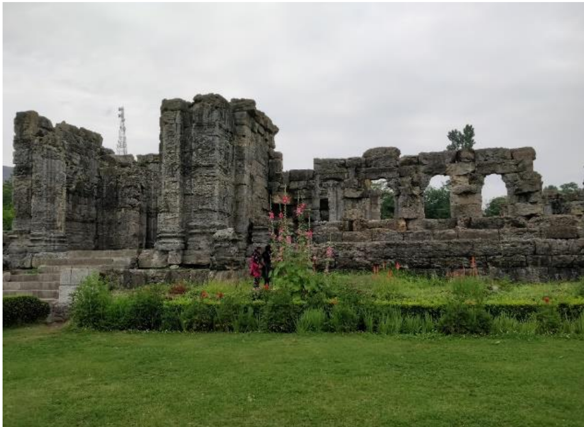
Figure 1: Entrance of Martand Sun Temple

Martand Sun Temple (Figures 1-4) is a heritage monument recognized by Archaeological Survey of India. situated near town Islamabad (officially called Anantnag). This temple is one of the main three major Sun Temples in India, Modhera Sun Temple, Gujarat and Konark Sun Temple, Orrisa respectively. Constructed by King Lalitaditya, which the emperor got built in honor of the Sun God (Wasim, 2018). The main shrine is 220 feet long and 142 feet wide and there are 84 smaller shrines that surround it (Majid, 2018). It is a fine example of architectural masterpiece (Figures 5-6) which is reflected from a far distance while approaching towards the shrine. It is still unbelievable how such a huge and tall structure could have been constructed during eighth century. Chiseled details into the stone of various Hindu Gods can be identified as a quality of fine workmanship. Temple is not of its original shape because of its demolition by a Muslim ruler Sikandar Butshikan in the early fifteenth century AD (Wasim, 2018). Even in a dissembled state, the temple still pleases the admirers or visitors. Therefore, this temple is of immense value considering its historic and religious aspect.