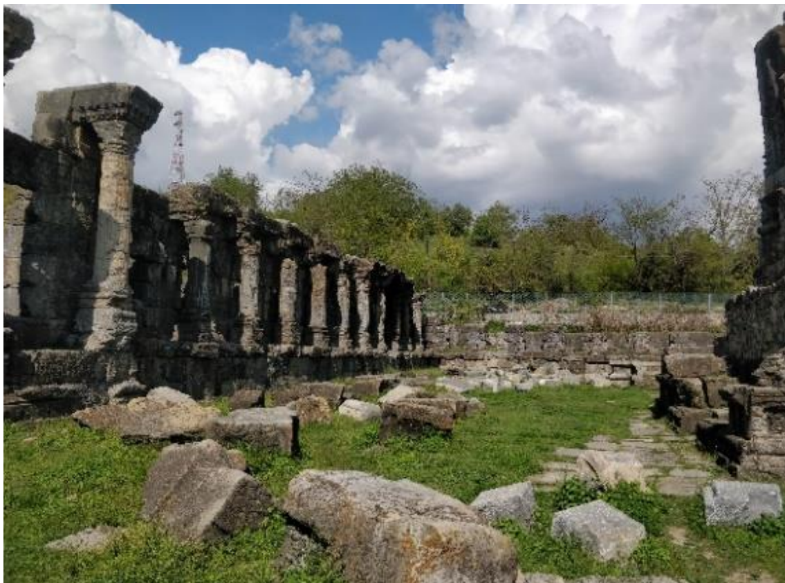
Figure 9: New Stones and collapsed stones of the Martand Sun Temple