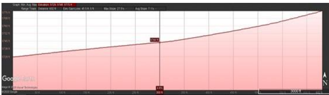
Figure 5: Section of site topography - left to right