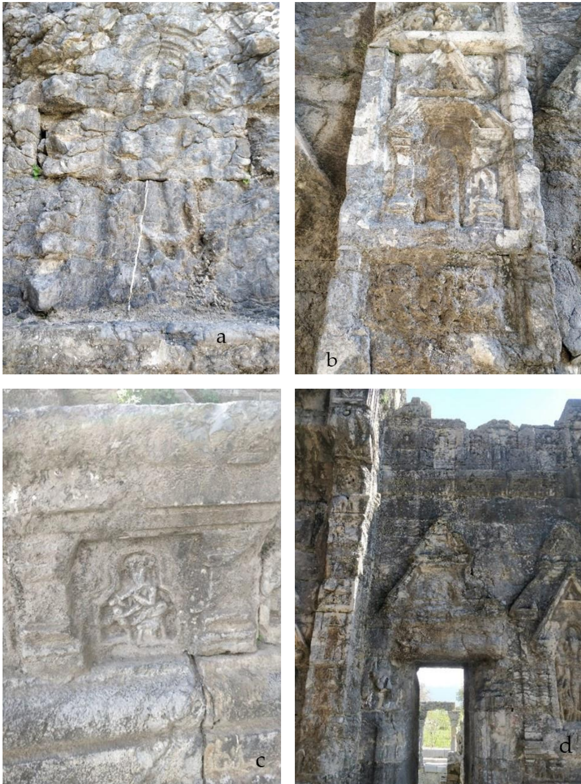
Figure 11 a, b, c and d: Partially destroyed carvings in main shrine of the temple

Improvisation in the Current Process: By studying the failures in detail, we can overcome each problem with a particular solution which can help in the process of restoration. The political turmoil currently in Kashmir valley heavily effects the