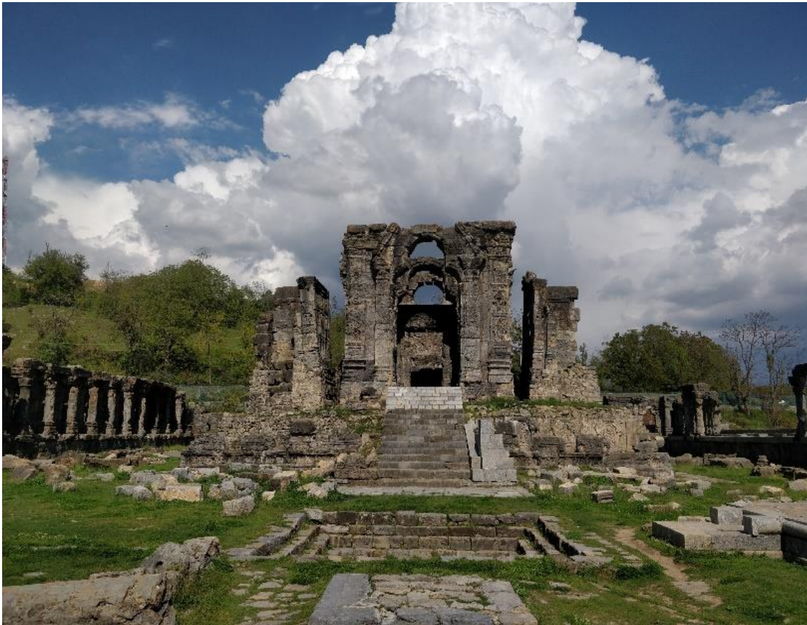
Figure 4: Main shrine in Martand Sun Temple

materials. But what can be observed on site is the traditional or conventional methods in the process of restoration. No justice has been done to a 1200 year old monument. In addition to this there is a negligence by the governing bodies by not considering the sacredness of this monument. No information is being circulated such as in newspapers, journals, magazines or any other kind of source which can arose the physical as well as moral value of the heritage site. No collection of historic data is done to restore the monument to its original form. The carvings into the megalith are not molded to their original form because of lack of data collection. These are left untouched and new non-decorated stones are being placed where there is a requirement of a missing stone. It is a piece of puzzle that doesn't fit in (Khan, 2020).