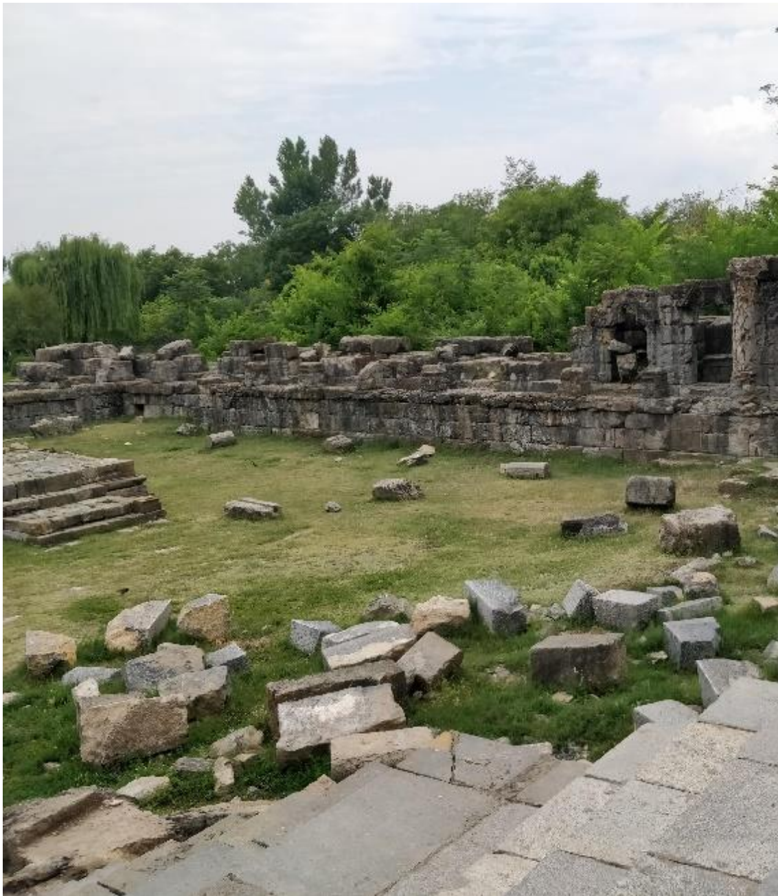
Figure 8: New Stones and collapsed stones of the Martand Sun Temple

visitors. Inside the temple. The pradakshina/parikarma or ambulatory path inside the temple now consists of mainly stones which are disseminated on the ground (Figure 7). These stones on the ground are majorly new ones, which are to be chiseled or placed (Figures 8 and 9). But no displacements of these stones can be seen from past three years by comparing the photos from 2017 and 2020 respectively. The temple is in the vicinity of a residential houses and no commercial cluster is surrounding the temple complex. The temple is easily accessible by the public transport and the number of vehicles per minute crossing the entrance road is one in an average. This time site is not open to public because of the global pandemic COVID-19.